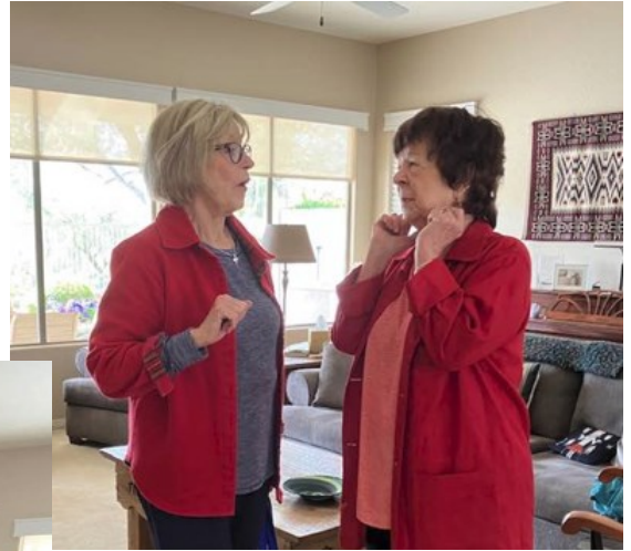
Our women's group recently had a great brunch together!